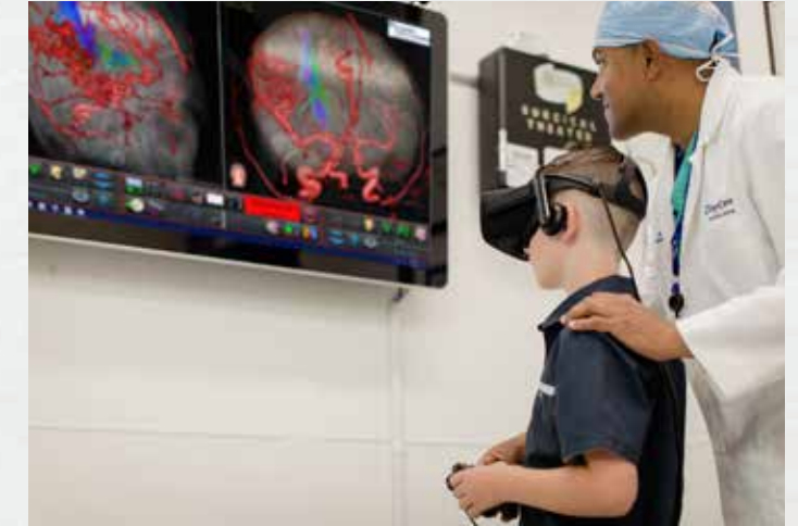
BayCare’s St. Joseph’s Children’s Hospital is the first pediatric hospital in Florida to use the Surgical Theater Precision Reality system, which allows young patients to see and understand the problem in their brains that will be fixed through neurosurgery.