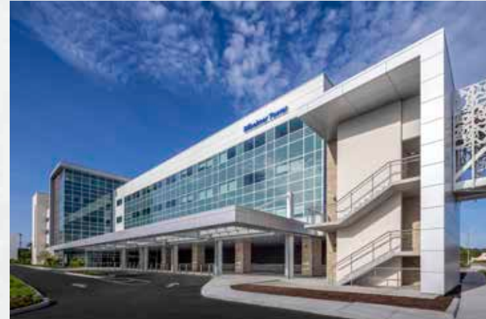
Mease Countryside Hospital's Bilheimer Tower opened in September.

Other hospitals in the BayCare network have gone through expansions or improvements on their current sites.