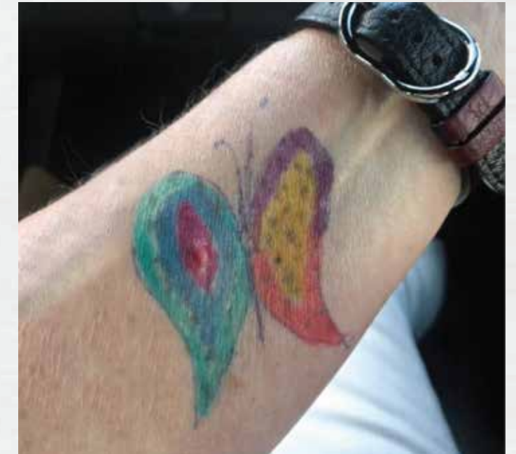
Mobile Response Team counselors responding to teens in crisis may encourage them to draw a butterfly on their wrist with permanent markers, give it a meaningful name, and protect it from fading or harm.

For more information about services offered through BayCare Behavioral Health, go to BayCare.org/Services/Behavioral-Health .