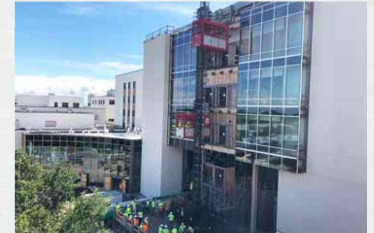
Construction continues on a $152 million expansion at St. Anthony's Hospital in St. Petersburg.