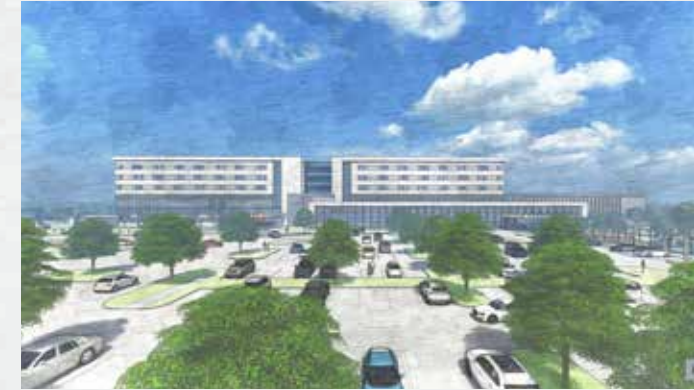
Artist's rendering of the replacement South Florida Baptist Hospital in Plant City.

At Mease Countryside Hospital in Safety Harbor, the Bilheimer Tower opened in September, which added 76 new licensed beds plus 30 observation beds, new critical care rooms and a new main entrance for the hospital.