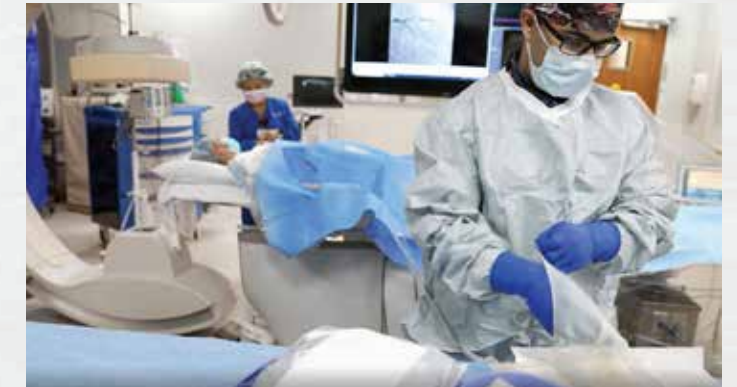
Members of the Bartow Regional Medical Center clinical team prepare a patient for a procedure in the hospital's catheterization lab.