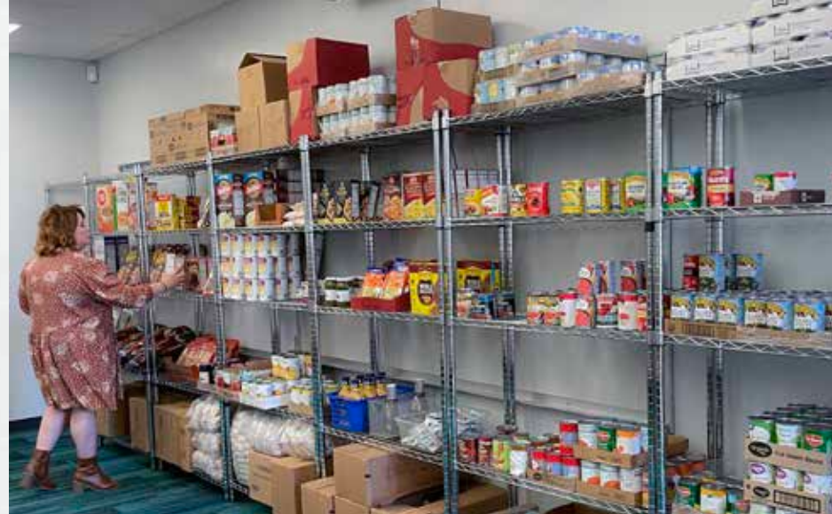
Eisenhower Elementary School secretary/bookkeeper Jenifer Jernigan arranges shelves in the school's Feeding Minds food pantry.

BayCare knows that food is essential to overall health and wellness and to students' long-term mental, physical and academic success. BayCare and Feeding Tampa Bay strive to provide a variety of foods that are healthy and nutritious. The school pantries are stocked with fresh produce, frozen meats and a wide assortment of dry goods such as flour, rice, beans, pastas, whole grain breads and more.