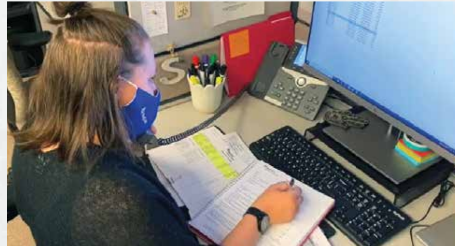
A staff member in the Hernando County Mobile Response Team office takes a call for help.