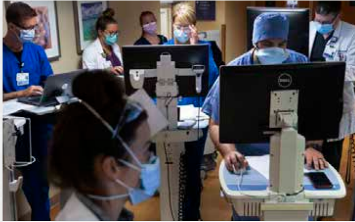
During the August 2021 COVID-19 surge, Morton Plant Hospital ICU clinicians meet in a hallway to discuss patients' care plans for the day.

As BayCare focused on care transformation during 2021, it reduced unnecessary utilization of tests; improved collaboration and communication among care teams; shared more evidence about best treatment practices with clinical team members; and put aside the assumption that a hospital is always the best place to deliver care.