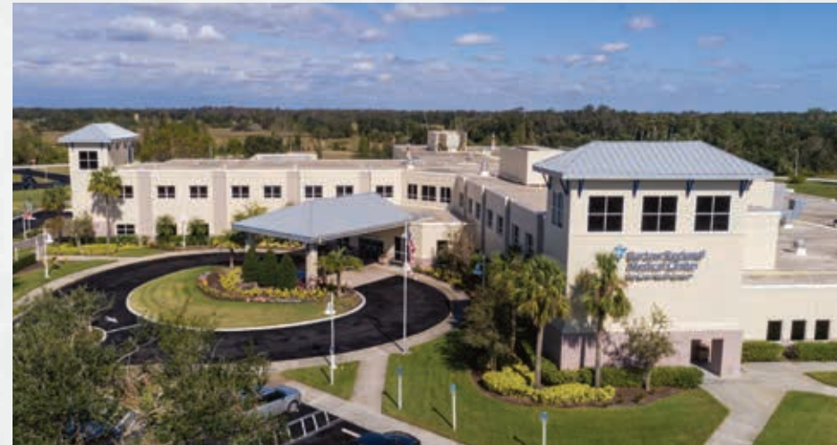
Since not-for-profit BayCare acquired Bartow Regional Medical Center from for-profit owners, the hospital has won accolades for its patient care.