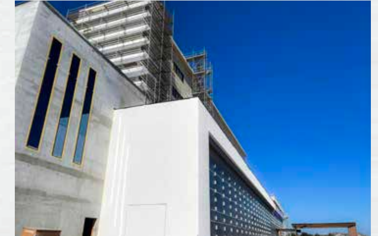
The front of BayCare Hospital Wesley Chapel, scheduled to open in early 2023.

In July, BayCare celebrated the opening of the first fixed location for La Esperanza Clinic on U.S. 301 South in Wimauma. The clinic offers free health care to low-income, uninsured residents of southern Hillsborough County.